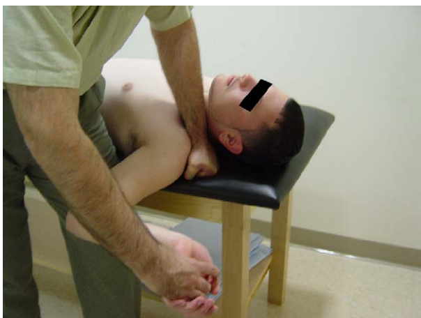
Figure 3 Glenohumeral lateral rotation.