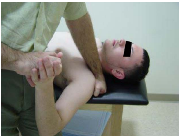
Figure 2 Glenohumeral abduction—wrist extension and supination.