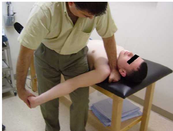
Figure 4 Elbow extension.